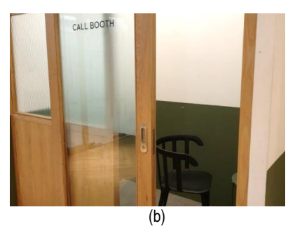
Fig. 8. (a) Private office; (b) Call booth.

Proper meeting rooms with fixed furniture allowing users to have collaborative activities. The smaller scale of board room areas with inspiring interior design for coworkers will enable people to interact.