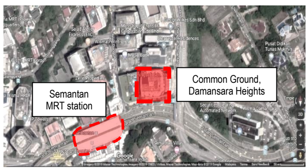
Fig. 2: Location Plan of Common Ground Damansara Heights

A case study will be carried out in one of well-known Malaysia's largest coworking space operator for coworking spaces - Common Ground Damansara Heights. It is situated at the penthouse of Wisma UOA Damansara II, Damansara Heights; which is close to surrounding business districts like Bangsar, KL Sentral, Petaling Jaya and Kuala Lumpur city (Fig. 2). Their slogan is "Ambition Lives Here" and their main ideas are to focus on community and lifestyle. At such, the reflectance of the coworking spaces design will be beneficial to this study.