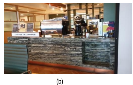
Fig. 4. (a) Lounge; (b) In-house cafe.