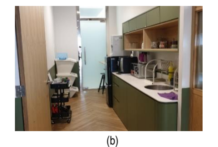
Fig. 6. (a) Print and copy area; (b) Pantry.