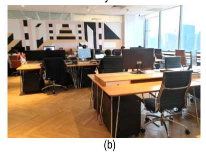
Fig. 7. (a) Hot desks; (b) Fixed desk.

Private offices designated for coworkers who need more privacy on doing their works. Less interaction happens here. Call booth as private areas which are enclosed for users to have call conversation.