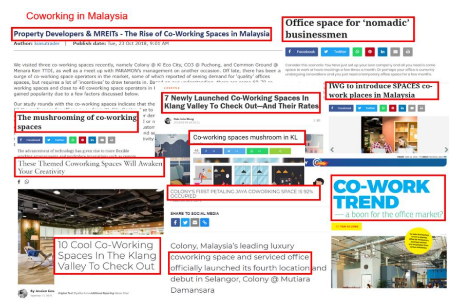
Fig. 1: Collage of recent years news publication of coworking in Malaysia

Table 1. Recent years publication from researcher in Asia