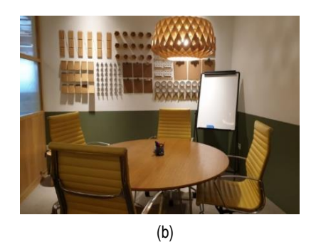
Fig. 9. (a) Meeting room; (b) Board room. (Source: Author, 2019)