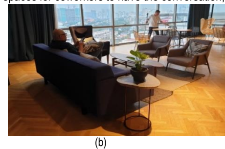
Fig. 5. (a) Event space; (b) Discussion area.