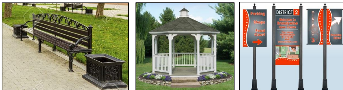
Fig.4. Examples of street furniture in public space

Several studies explore that access and linkage about the human needs and comfort at public space. This aspect is important to ensure the convenience of users whereby it serves as accessibility to all facilities in the public space. This view is supported by Rosly et al. (2013) that developments should highlight the user's comfort, integrated with the surrounding urban fabric to create continuity in the public realm, green spaces and pedestrian networks. It means that physical planning of public space should emphasize the comfort and safety features so that the users will continuously and spontaneously use the public space without coercion. Figure 4 shows the examples of street furniture in public space.