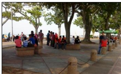
Fig. 3. Activities and users in Padang Kota Lama.

The study area is connecting with Jalan Padang Kota Lama, Jalan Tun Syed Sheh Barakbah and Lebu Light. The study area surrounded by buildings and historic sites such as Fort Cornwallis, Esplanade, Town Hall, City Hall and Cenotaph. There are some facilities provided within the public space in connecting users with a place for their activities. It includes food court, promenade walkway,