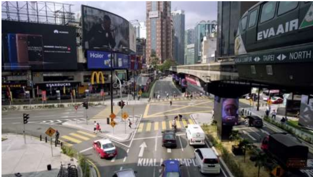
Plate 1. Bukit Bintang, Kuala Lumpur

the local food, and secondly, we are not sure what feature of the food affects their purchase intention. Nevertheless, the tourists may already have an image of the local food formed by the advertisements, social media and also by word of mouth. Therefore, two-fold research objectives are formulated to determine the tourists' level of experience of the local food. They are: (1) to examine the characteristics of local food based on the tourist's experience and preference and (2) to examine the environmental factors that lead to the tourist's experience of local food.