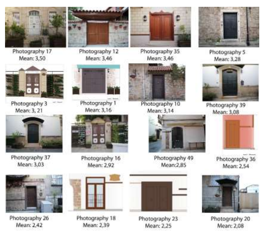
Figure 4. Preferences for entry spaces

Another linear multiple regression analysis was performed by liking degree of freshmen architecture students on the sample entrance surfaces as a dependent variable (Table 4). In this analysis, the perceived inviting degree, complexity, and mystery were used as independent variables. The results showed that there were two significantly useful variables on liking degree of the freshmen architecture students. These were perceived inviting a degree of the entrance surface and mystery degree of the entrance surface. Independent variables explained 60.7% of the variance on liking degree of the entrance surface (F=949.749 df= 3-1692 p<0.001).