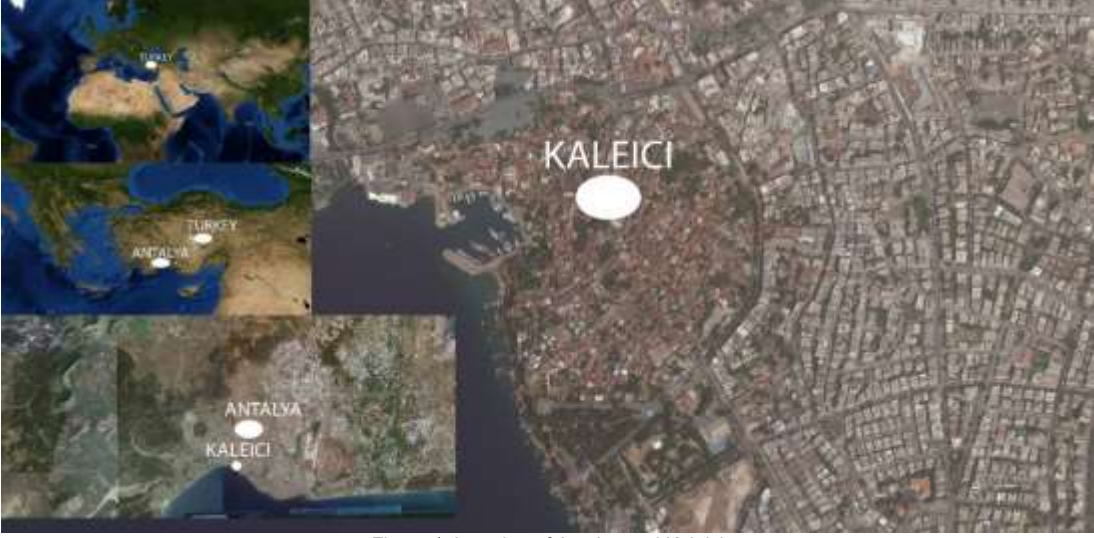
Figure 1. Location of Antalya and Kaleici

The Antalya province is situated in southwest Anatolia between the longitudes 29°20'-32°35' East and latitudes 36°07'-37°29' North. The city, located on the Mediterranean coast, is bordered by the Mediterranean Sea to the south and the Taurus Mountains to the north (Figure 1.).