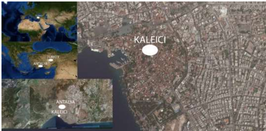
Figure 1. Location of Antalya and Kaleici

The Antalya province is situated in southwest Anatolia between the longitudes 29°20'-32°35' East and latitudes 36°07'-37°29' North. The city, located on the Mediterranean coast, is bordered by the Mediterranean Sea to the south and the Taurus Mountains to the north (Figure 1.).