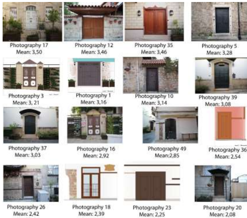
Figure 4. Preferences for entry spaces

Another linear multiple regression analysis was performed by liking degree of freshmen architecture students on the sample entrance surfaces as a dependent variable (Table 4). In this analysis, the perceived inviting degree, complexity, and mystery were used as independent variables. The results showed that there were two significantly useful variables on liking degree of the freshmen architecture students. These were perceived inviting a degree of the entrance surface and mystery degree of the entrance surface. Independent variables explained 60.7% of the variance on liking degree of the entrance surface ( F=949.749 df= 3-1692 p<0.001 ).