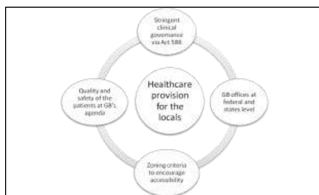
Fig. 2: Private healthcare sector with its distinctive Branch under the MOH signifying the provisions of healthcare for the locals

'... everyone gets access to healthcare. Otherwise, everyone needs to go to Kuala Lumpur to get access to good hospitals, and this shouldn't be happening'.