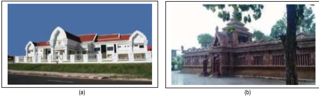
Fig. 2. (a) Detudom Provincial Court, Ubun Ratchathani ; (b) Wat Ban Pluai Yai, Roi Et.

The study of identity recognition in South Isan (Northeastern region of Thailand) uses the perception test. The photo samples show the city hall design, which is like the Kopura or the arch of the stone castle, which is one of the stable architectural features in the South Isan area.