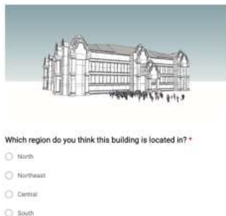
Fig. 4 The questionnaire