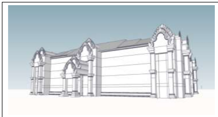
Fig. 3: The sample in the questionnaire

The testing with the perception process is reliable (Lynch, 1960; Prak, 1977; Stamps & Nasar, 1997; Gifford, 1999; Zanordin, Abdullah & Baharum, 2012; Kiruthiga & Thirumaran, 2016; Hegzi & Abdel-Fatah, 2017). The exercises of local identity design were practiced to architectural studio design. Come up with some critiques; the designate approached the contemporary style. This research used the perspective image from SketchUp to be a sample in the questionnaire.