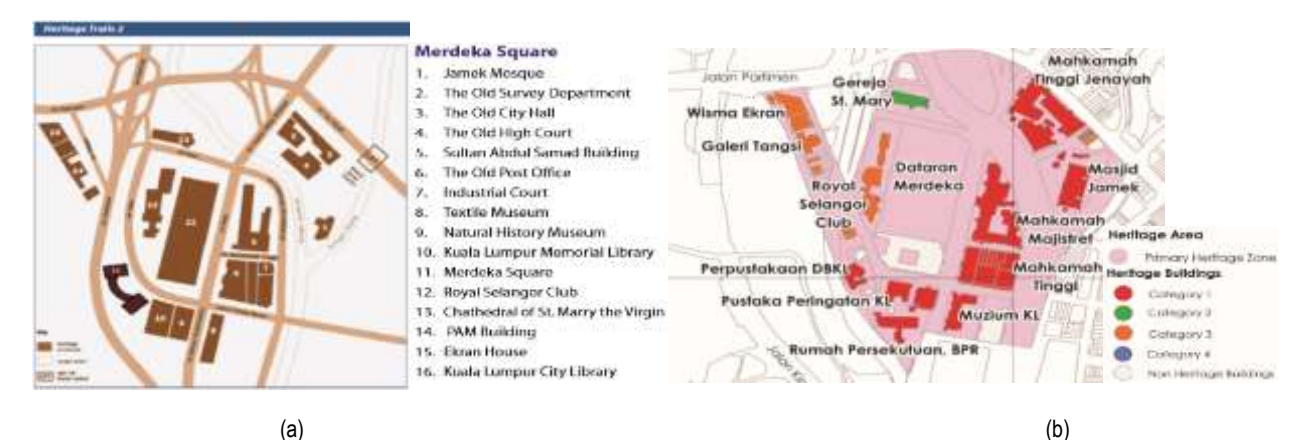
Fig. 2. (a) Merdeka Square Heritage Trail; (b) Merdeka Square under the Primary Heritage Zone - surrounded by various categories of heritage buildings. (Sources: (Kuala Lumpur City Hall, 2008a, 2008b))

Under the DKLCP2020 , the Padang is recognised as one key venues on the heritage trail of Kuala Lumpur, under the Strategic Direction 3.3: Promoting International Tourism. Named under 'Heritage Trails 2: Merdeka Square', this recognition indirectly recognises the historic importance of the Padang (Kuala Lumpur City Hall, 2008a, p. 40). Under the Strategic Direction 9.1: Designating Heritage Zone, the Padang is grouped under a 'Primary Heritage Zone'. This zone is a "core area for conservation which is contiguous and contains groups of buildings gazetted under the National Heritage Act 2005 " (Kuala Lumpur City Hall, 2008a, p. 129). Development in this zone is controlled to ensure new development does not adversely affect the appearance of the existing buildings including the public open space (Kuala Lumpur City Hall, 2008b, p. 180) (See Fig. 2(a) and 2(b)). However, further subsections in the DKLCP2020 discuss regulations only pertaining to these heritage buildings.