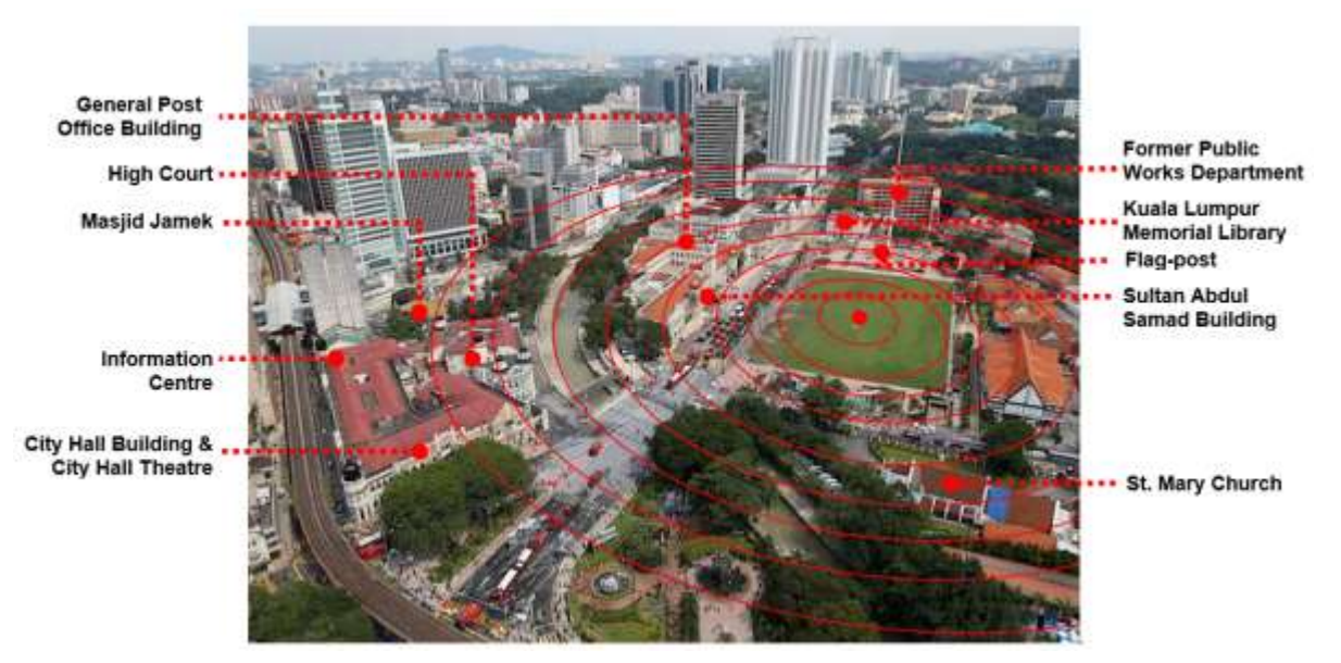
Fig. 3: Merdeka Square acts as a centre to other National Heritage Buildings in Kuala Lumpur

guidelines, "we might be destroying all the historical elements which give meanings to the building" (PP3). For participants, the implementation of a Special Area Plan was envisaged as being a more comprehensive approach because it involves an analysis of an area rather than an individual building (GA1, GA2, GA4, KLLA1, KLLA2, KLLA3, PP2, and PP3).