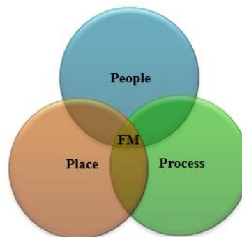
Fig. 2: The FM triangle