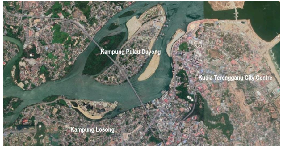
Fig. 1. Map of the study area

Kampung Losong is located near the Kuala Terengganu river with 11 sub-villages located opposite Wan Man Island. Historically, the villagers of Losong are well-known for their knowledge of the marine sciences conveyed by the Bugis community. At the same time, the local people of Kuala Terengganu are skilled in carpentry. As a result, they combine these skills to produce high-quality boats. Significant roles played by boat making activities in the early 18th and late 19th centuries have turned Kuala Terengganu into international trading port. The socio-economic activities of the villagers of Kampung Losong were songket textile businesses, small-scale trades and fishing. Nowadays, the village is growing exponentially, with more people working in the city and doing small business.