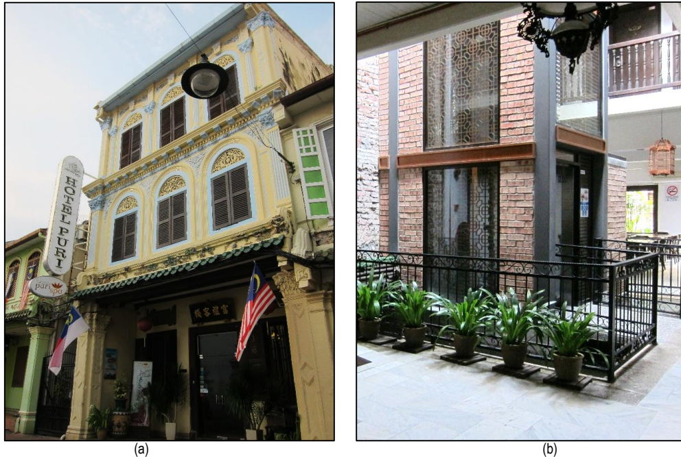
Fig. 2. (a) Hotel Puri beautifully conserved façade; (b) Elevator adapted at Hotel Puri airwell.

The second case study, Hotel Puri, also provides good accessibility adaptation throughout the hotel while successfully preserved its Peranakan cultural heritage with its abundant display of antiques and original building fabrications. The hotel elevator with fully accessible fittings (i.e., appropriate rail and Braille buttons design and height for PWD) is brilliantly adapted at one of the building's airwells. Besides, the elevator design matches with the interior scheme and style, as if the accessible facility was already a part of the building heritage, as depicted in Fig. 2(b).