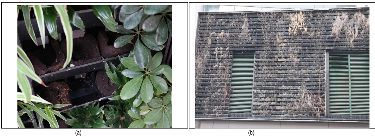
Fig. 2. (a) Hydroponic sponge as a soilless medium is widely adopted in LWS of Hong Kong. (b) Plant failure is found more common among outdoor LWS which rather dependent on a robust irrigation system.