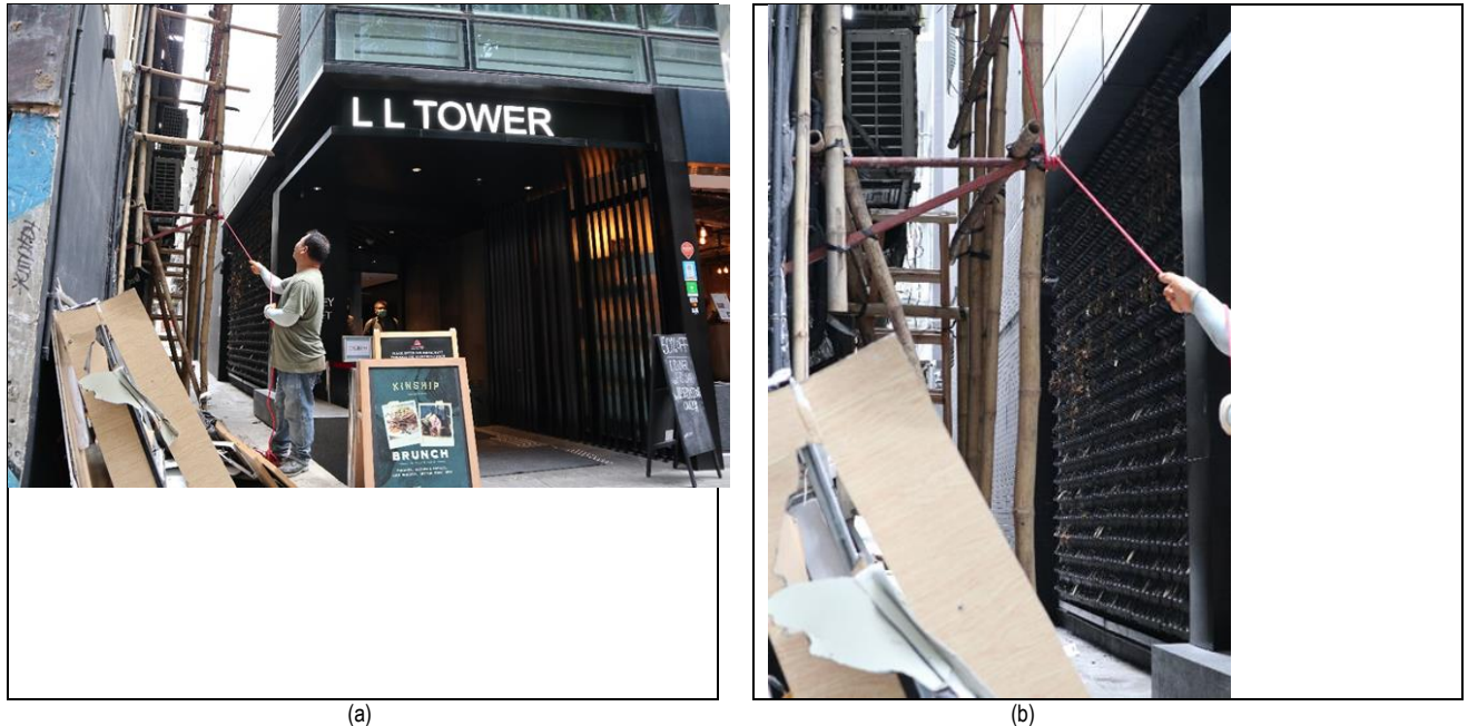
Fig. 3. (a) An outdoor VGS was built on a façade facing a narrow alley between two tall buildings. (b) A close up view showing dead wilted plants remains on this VGS.