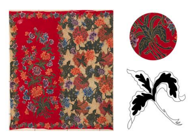
Figure 4.6 Water Spinach or Kangkung.