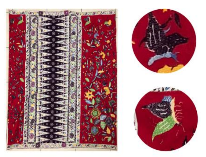
Figure 4.7 Butterflies depicted on the imitation batik sarong.

Fauna motifs are motifs of animals that are commonly used in batik sarong whether in batik block, canting or silkscreen batik. Fauna also found in imitation batik sarong and kain panjang (long cloth) from Indonesia. Several other countries have the same application of animals in their fabrics. The implement of animals or fauna in fabrics defines the identity of a community. These are because of wanted to portray their belief in describing and glorify in what they believe. Sometimes, the depicting of animals in fabrics were related to promoting tourism in certain places. Example in Terengganu, sometimes batik was found full of sea turtle portrayed on the batik. That is because sea turtles are very famous in Terengganu, and Terengganu was elected as the sea turtle sanctuary.