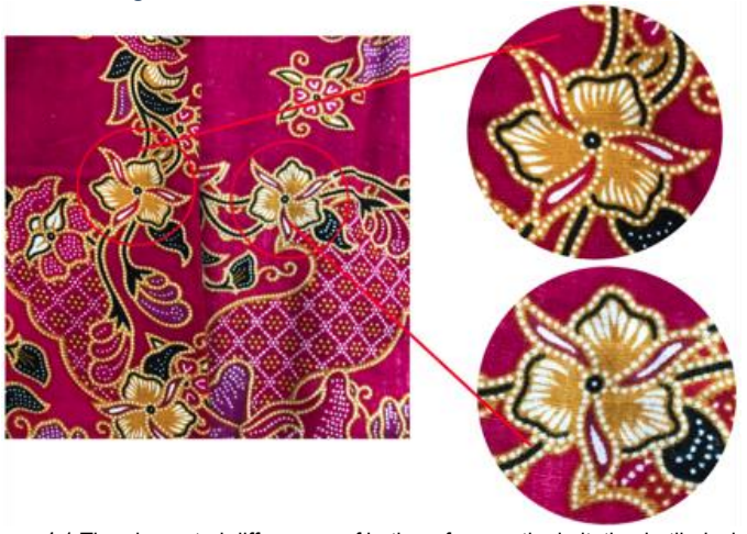
Figure 4.1 The pigmented differences of both surface on the imitation batik design.

The imitation batik sarong design is similar to some of the batik design from other countries. The layout of the design is seen with a particular characteristic. Other countries are trying to imitate and copy the design that defines cultural identity. The imitation of batik design is sometimes exported to other countries. Such as Indonesia, they shipped their imitation Javanese batik into Malaysia and Thailand, same as Thailand, they exported their imitation batik into Malaysia. Thailand imitation batik was usually, sold in the North of Malaysia. Typically, the differences between batik imitation from Java can differ from imitation batik that is made from Thailand. A Thailand made imitation batik sarong owns its pattern and design layout. For most of Thailand made, that are usually have flanking borders made up of the creeping flowers as well as the bamboo shoot that stood in vertical. These criteria have been found like in the researcher collection, which was shown in Figure 4.3. Furthermore, the other criteria are the most of the imitation batik sarong parts, especially in the badan kain (the body) covers with flowers. In this case, the imitation batik sarong in Figure 4.2 shows several gigantic flower bouquets.