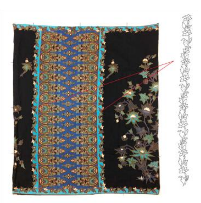
Figure 4.2 An example of Thailand made imitation batik sarong.

Apart from the characteristic matter, the design of imitation batik sarong, there are several values to look upon to, such as colours as stated in the literature review, which some colours are represented by culture and identities in traditional batik. For instance, Javanese batik has its colour code depending on their religion and region. Every design of colours does not simply copy each other. Despite all that, in imitation of batik sarong design, the batik was all about colours. The more the colours, the merrier the imitation batik can be produced. Because the availability of a variety of dye colours, the imitation batik producer can make it comes in a range. So, from that, a lot of beautiful colours imitation batik are produced. The imitation batik sarong applied a variety of colours include the bright to warm tones colours. They only use synthetic pigmented colours in imitation batik.