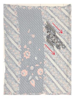
Figure 4.3 Diagonal pattern on the badan kain (the body).

The design layout is the arrangement of design on a specific surface. The design layout of the imitation batik is a placement or arrangement to fit accordingly in the structure of batik sarong. Designing a layout of batik sarong is not simple. Expertise is needed to 104