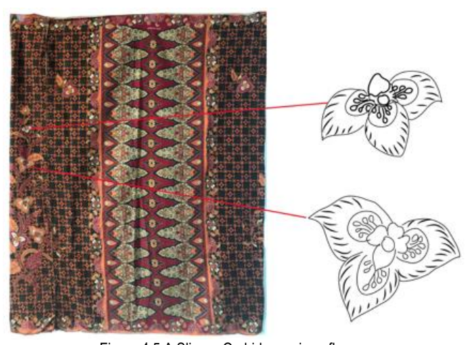
Figure 4.5 A Slipper Orchids a unique flower.

Nevertheless, imitation batik design is also imitated from the same design, and sometimes they were stylised. Some of the imitation design was derived from blooming flowers that have many petals, such as Roses, Sunflowers, Hibiscus, bunga cempaka (magnolia champaca) and bunga pecah lima (five petals flower.) Apart from the flowers, there are vegetal motifs that are applied in imitation batiks, such as Yam leaves ( caladium ), water spinach and other vegetal design.