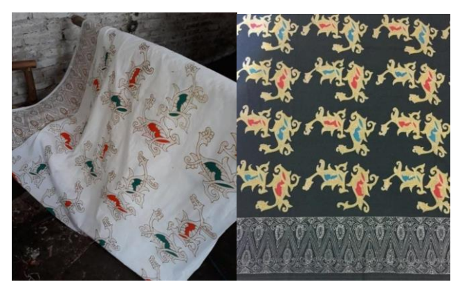
Figure 5.8: The design of Ayam balatiang Batik Motif that has been produced ion a form of batik fabric.