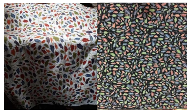
Figure 5.5: The design of Garundang Mandi Tadpoles, produced in the form of handmade batik cloth