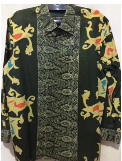
Figure 5.9: The design of Ayam balatiang Batik Motif, which has been produced in ready-to-wear Batik form rooster motif is an abstract depiction of a rooster, or commonly also called a rooster (Syaidam, 2004).