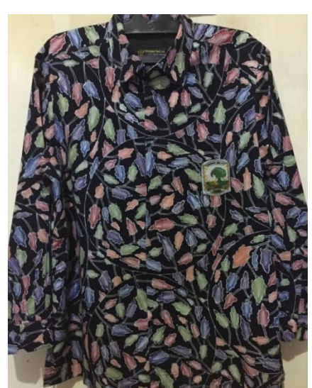
Figure 5.6: The design of Garundang Mandi, produced in the form of ready-to-wear batik shirt