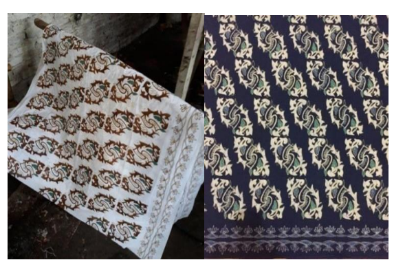
Figure 5.2: The Design of Bean Leaves Binder Batik Motif that has been produced in the form of handmade.