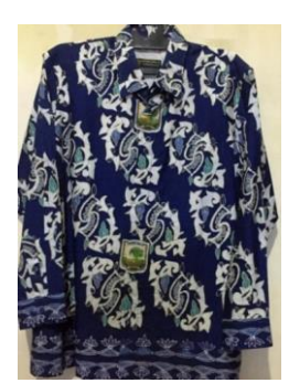
Figure 5.3: Design of Bean Leaves Binder Batik Motif that has been produced into ready-to-wear batik shirt.