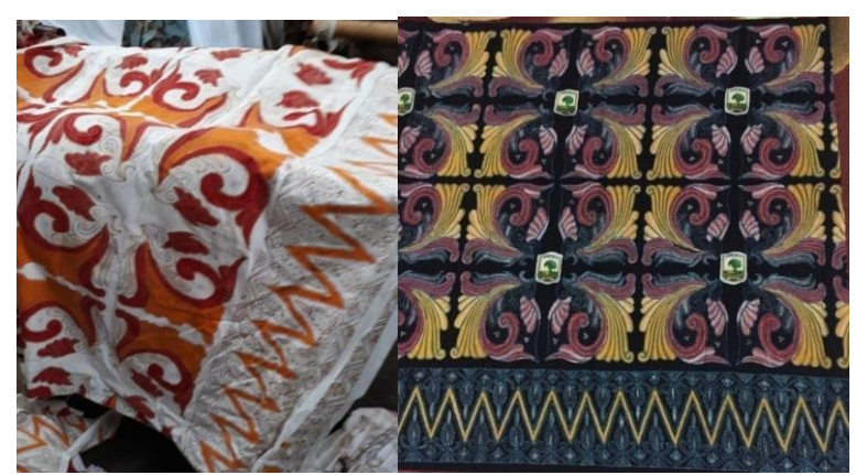
Figure 5.11: (Andalas University Rooster Batik Motif), produced in a handmade mode.