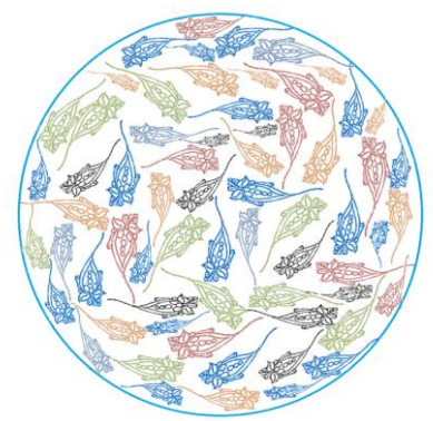
Figure 5.4: The design of Garundang Bathing Motif. (Designed by Herwandi, 2016).

Garundang Mandi Motif is one that describes an abstract motif of a group of tadpoles offsprings. Garundang is a term used by the Minangkabau community for tadpoles offsprings (Syaidam, 2009a). In Minangkabau cultural vocabulary, there are several terms associated with garundang, such as gadang garundang di kubangan (Syaidam, 2009b). The term gadang garundang di kubangan (big tadpole in backwater), is a term that describes that the habitat of garundang usually found in buffalo puddles with an inadequate amount of water. This reflects that garundang represents a small community, living in small "habitat," but they preferred to live in togetherness. Togetherness is the strength, as well as the beauty of their lives. A little while, the garundang continue living and grow big in the backwater. Thus, the saying Gadang garundang di kubangan will mean that garundang shall have their might in their habitat. This reflects that one will acquire his/her dignity within his community; if he/she is living among the people who do not recognise him, he remains an ordinary person.