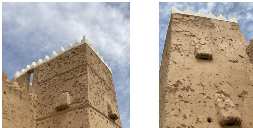
Photo4.3 poor condition of the decoration on the tower.