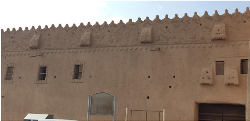
Photo 4.6 Defensive elements and decorations on the palace walls.