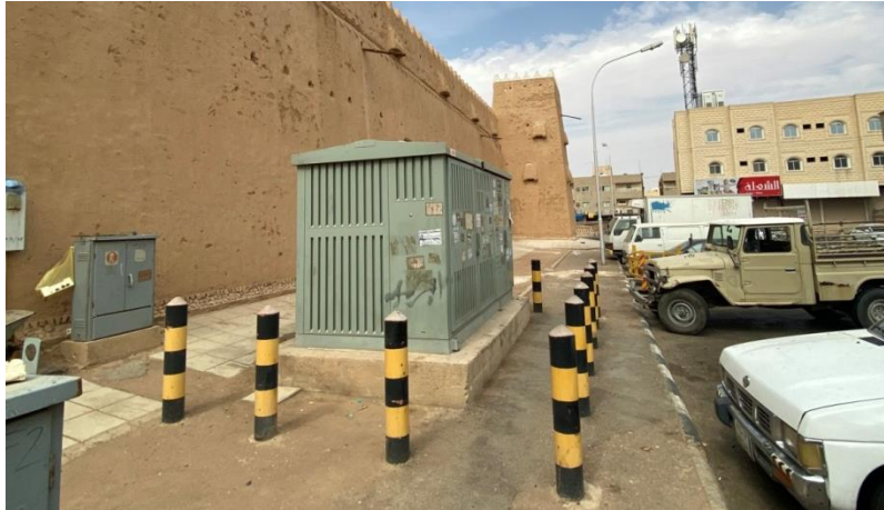
Photo4.2 the visual distortions contrasting with the building and its historical and aesthetic value

Al Qieshlah palace is situated in the middle of Hail city see photo 4.1. From the observation and the site visit to the case study area, it becomes clear that the Al Qieshlah was a significant historical building that is considered one of the most prominent landmarks in Hail city, the palace surrounded by commercial streets, modern facilities, and markets from all directions, all these effects contributed to giving an image and visual distortions contrasting with the structure and its historical and aesthetic value. It can be deduced that palace's surrounding area is suffering from a loss of archaeological significance, as the area surrounding was treated separately from the historic building. As shown in the photo 4.2