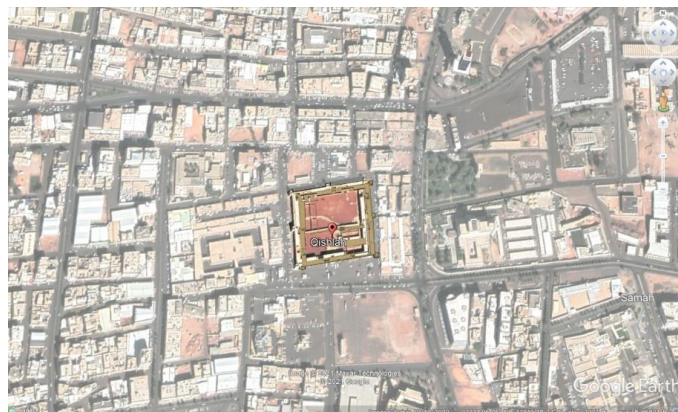
Photo4.1 location of king Abdul-Aziz palace in Hail (Al Qieshlah)