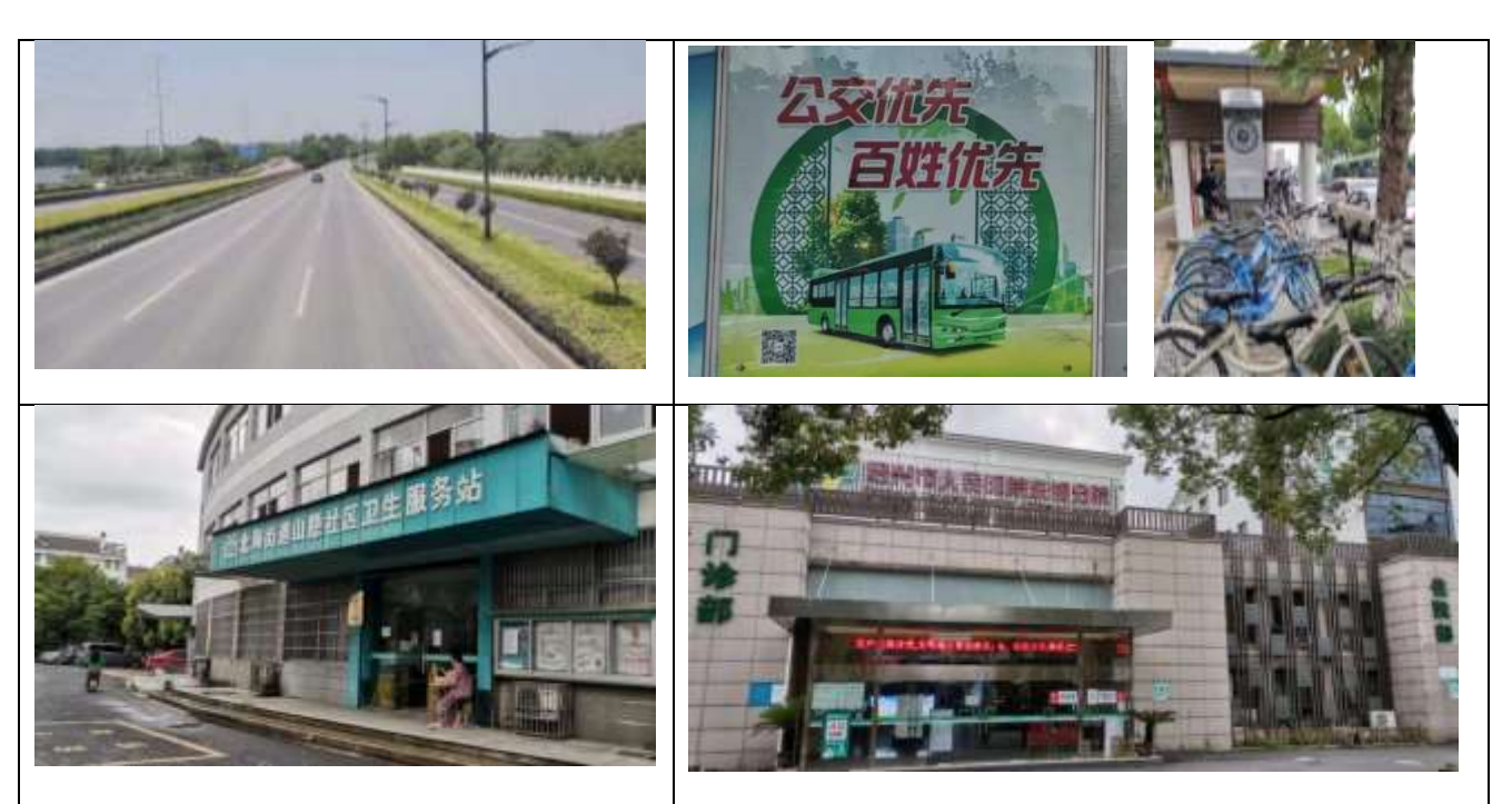
Figure 4. Infrastructural, Public Transportation and Healthcare Services

Rural cooperative medical security, funded by individual contributions and local/central governments, covers major diseases to reduce the burden of farmers and benefit the people. The standard of contribution for farmers in 2020 was 280 yuan per person per year and the period of entitlement is in 2021. The security includes general outpatient treatment and hospital basic medical treatment. Reimbursement rates vary according to different levels of hospitals and treatment costs. Pictures below show the community medical treatment spot and a hospital in Dongpu Town, Keqiao District (see Figure 4). Nearly 90% of the town-level hospitals in Shaoxing City