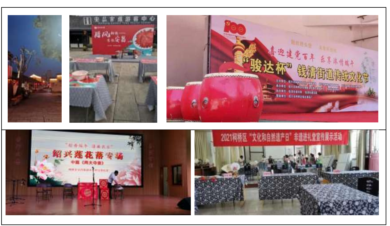
Figure 3. Cultural Activities and Promotions

with a strong transportation system. Every village could be reached through public buses. Passengers can see when the bus will arrive or how far the bus is from the current stop on the electronic screen or by scanning a QR code. Usually, there is still some distance away from the bus stop to the destination. Public bicycles, free for one or two hours, could be seen near many bus stops.