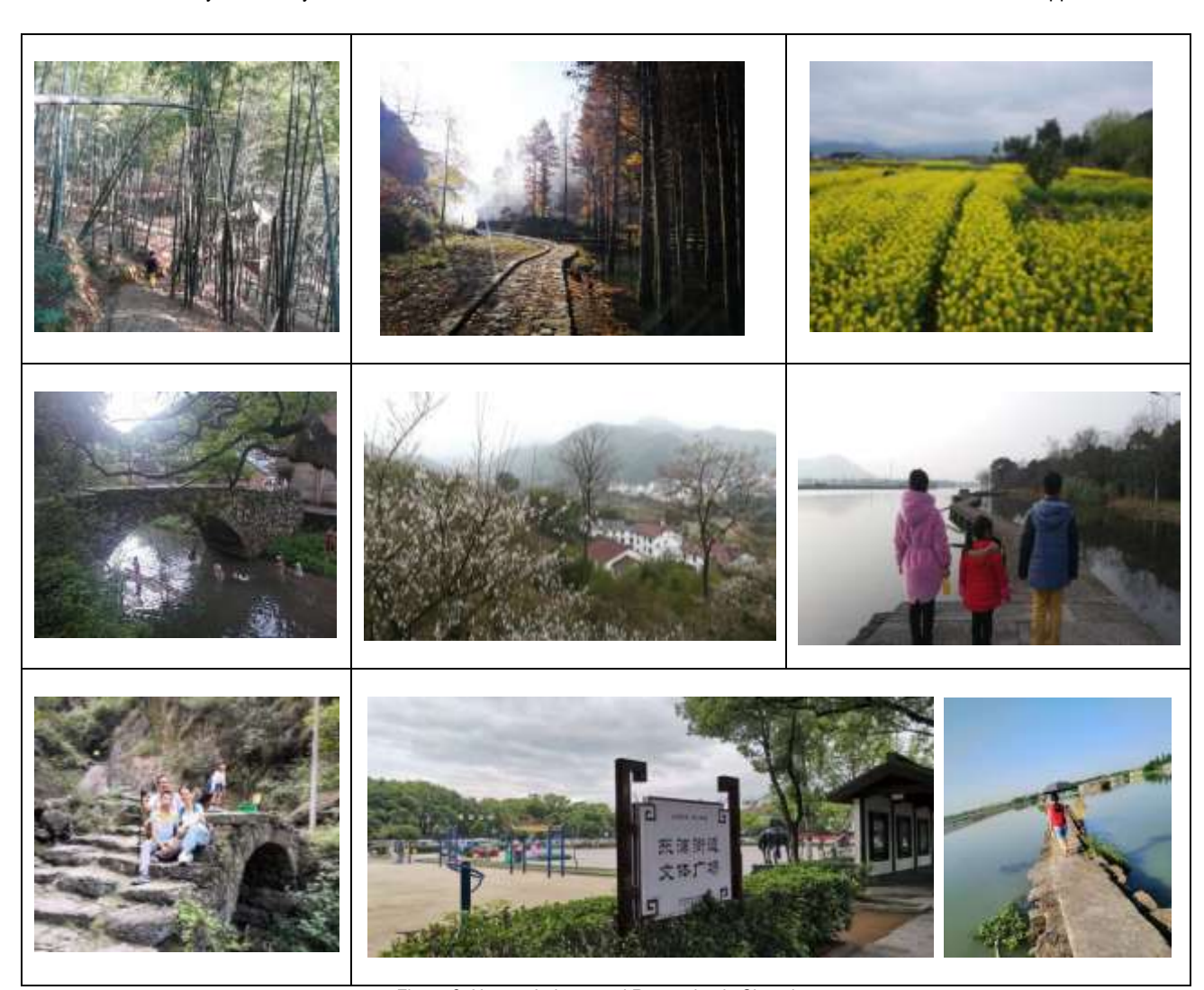
Figure 2. Nature, Leisure and Recreation in Shaoxing

Nowadays, people pay more attention to the body health aspect. Square dancing is popular in China. In Shaoxing, apart from square dancing, people enjoy a stroll if there's a footpath nearby. On weekends or during holidays, hiking is a favorite activity. Friends and relatives call each other and climb a mountain together. They would have a picnic on the mountain or dine together in a restaurant after climbing. It's a good way to promote intimacy and health. There are many punch spots. For example, Fuzhishan golden cole flowers and Wanweishan cherry blossom in spring, Ten Mile Lotus Pond in summer, golden ginkgo leaves in parks, and Xuedou Ridge redwood in autumn. The variety of scenery adds to the colorful life of citizens. Nature and leisure are essential for household happiness.