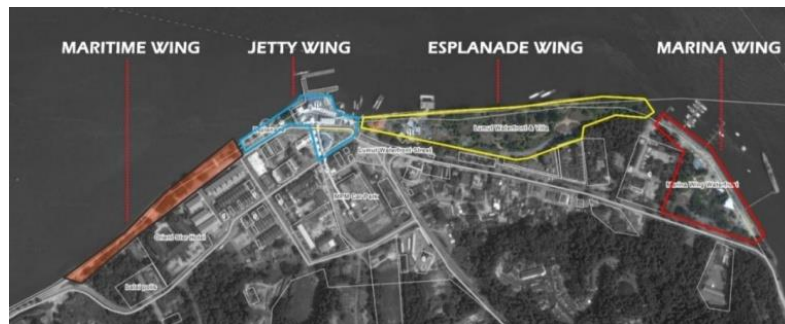
Figure 3: Location of Lumut waterfront Source: Google Maps. (2016). Lumut township

Each segment is developed with different architectural approaches and concepts to suit with the overall master planning. The activity and design are continuous for each different segments. Based on previous studies, the researchers identified several important aspects related to the CPTED. The data presented in Table 4 are findings based on the elements of CPTED, observed for the site.