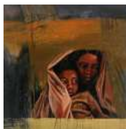
Yusri Sulaiman, " Anat = Waiting. "

This work of art contains two types of shapes: organic shapes, such as human figures and unknown creatures, and geometric shapes, such as typography and stamps. Next, the artist employed a brownish hue for the entire artwork's form. The texture is also present in this piece of art, as evidenced by the brushstrokes. This artwork also contains the element of line, which can be seen in the typography, the box texture line, and the stamp shape. Based on the subject's appearance, this artwork can be considered realistic.