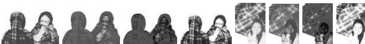
Figure 5: Digital films (cyan, magenta, yellow and black)

The researcher was required to produce digital films to move on to the subsequent stage of this research, which is making blocks for the silk screen technique. The researcher has converted the digital composition to a four-colour separation, consisting of cyan, magenta, yellow, and black. This is how digital compositions are created. The radius of 8 points was chosen for the halftone that was utilised in this study. The digital films for each of the four colours are displayed below in figure number 5. Following printing the images using CMYK film with four-colour separation, they were exposed in the dark room as one of the silk screen processes shown in Figure 6. The test print procedure must be carried out to experiment with the silk screen block.