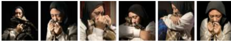
Figure 2: Visual data

This section illustrates the evolution of an idea through manual and digital compositions. The researcher plans to examine facial expressions and the symbolism of the sarong , which represents sorrow. The use of the sarong as a symbol for expressing emotions because the symbolism is more potent than creating images of facial expressions alone. The visual data collection is shown in Figure 2 below. The sketches and drawings (Figure 3) are also done based on the visual data collected in the previous phase.