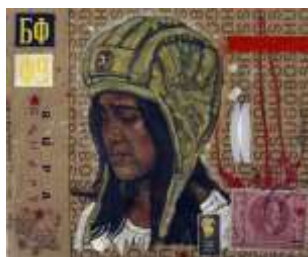
Anurendra Jegadeva, All I Got from Berlin

In this study, the researcher has selected some artworks to serve as references. The element determines the artist's references' content, technical approach, and proportions or composition. Anurendra Jegadeva created " All I Got from Berlin " in 2012 using oil on a medium-sized Boss shopping bag enclosed in an acrylic box. The artwork's dimensions are 46 x 40 cm. The researcher discovered a woman, a stamp, typography, and a tank helmet in this artwork, as shown below.