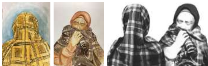
Figure 4: Final Composition