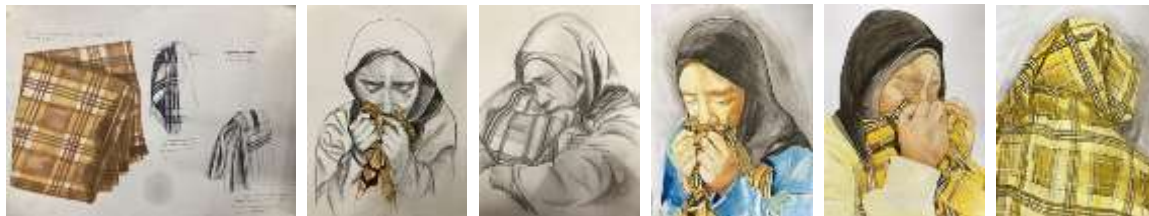
Figure 3: Sketches and drawing