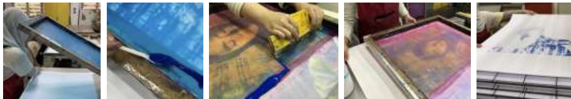
Figure 7: Printing process