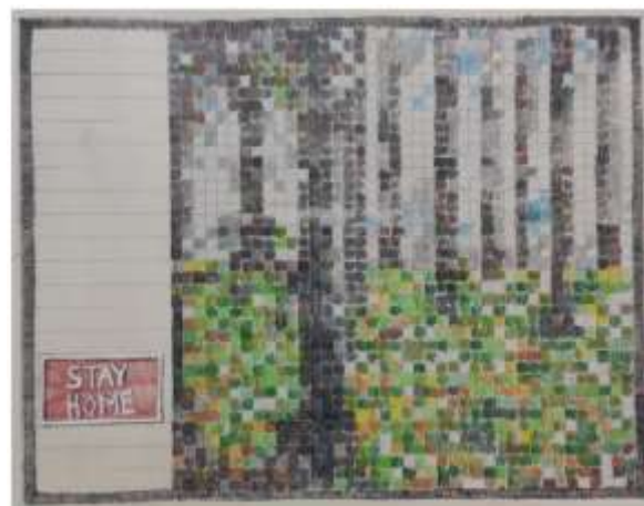
Figure 2: The collected information, including theories and concepts that were used and related to the study are infused into the final sketches and drawings that were created.