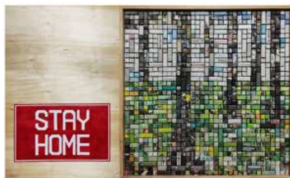
Figure 3: New Norm II, 150 cm x 90 cm, Ads Material, Newspaper and Lacquer Spray in Wood Frame, 2021