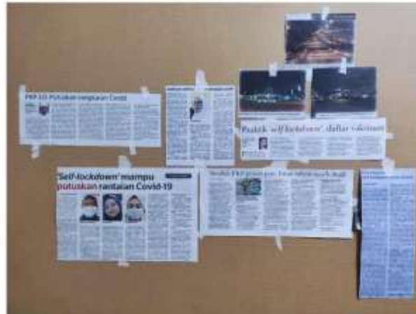
Fig 1: Data Collective (Newspaper Excerpt)