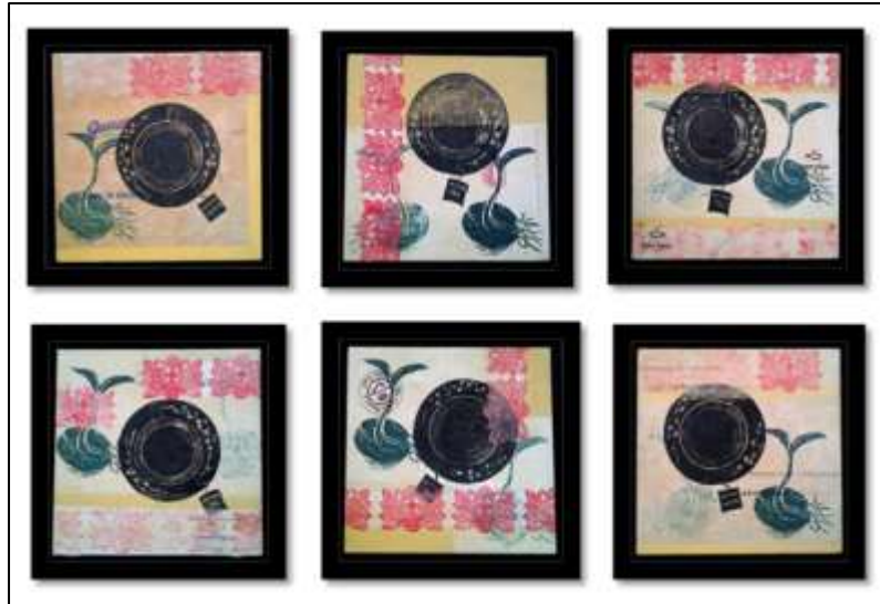
Fig. 5: Growing Together 1-6 , 2014, 35x35cm each, Mixed Media Printmaking by Rosiah Md Noor.

The colourful image of the three-dimensional Putu biscuit is produced during the making process of papier-Mache and can be maintained after removal from the mould. The contrast in colours produced means to create differences, and it differs from the original colour of Putu biscuit, as the reason to produce opposite direction between original Putu biscuit and modern colourful cakes. The printed Putu biscuit was collaged and composed in a specific composition for formalistic and meaningful purposes. For example, in the artwork Between Two Coffee , colour mould print was placed vertically in the centre of the composition, giving another form of contrast or conflict with an actual Malay dishes order full of politeness.