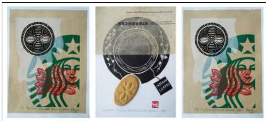
Fig. 4: My Kueh Putu and Favorite Coffee , 2019, Triptych-26x19cm each, Mixed Media Printmaking, by Rosiah Md Noor

The artworks entitled Instant and Instant Live can categorize as Hybrid Printmaking. Both are created by combining digital print with the traditional relief print technique, producing penetration images with new effects. While the artwork entitled Growing Together 1-6 (Fig. 5) and Red Carpet 1 & 2 was produced as 2-Dimension installation printmaking. Apart from the printed putu motif and instant coffee, images from the commercial printed tissue contented the fast-food logo are combined. These artworks give meaning to living and growing up with fast foods that have become a trend nowadays. It has described the traditional Malay biscuit of 'Putu' leave as a motif that adorns our life alone.