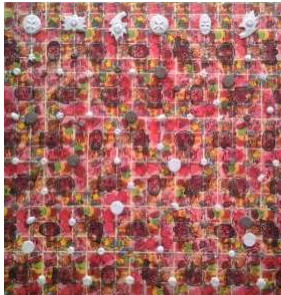
Fig. 3: Linkage of PUTU , 2014, 117cm x 117cm, Mixed Media Printmaking, by Rosiah Md Noor

The artworks include Between Two: Series I-V ; Between Two Coffee ; Putu-Putu ; Between Mug & A Cup of Coffee ; Linkage of PUTU (Fig.3); Intankah lagi siPutu , and My Kueh Putu and Favorite Coffee (Fig.4) are categorized under Dimensional and 3-Dimensional form of art print. These art pieces are mixed-media print using the relief print method, associated with Putu biscuit mould using papier-Mache to show the beauty of carved motifs. The Putu biscuit image was made three-dimensional so that it will easily be known as food. Unlike if produced in two-dimensional, it just gives a decoration look like flora in the background or contradictory images.