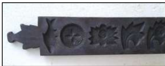
Fig.2: Putu biscuit mould

The artist encountered a highly eye-catching Putu biscuit mould while wandering through the Ipoh flea market, which sells various items that consider antiques. It is composed of hardwood and has flora and fauna designs engraved in black (Fig.2). The artist remembered how long it had been since it had been used to make Putu biscuits as she stared at the old, worn-out mould. The Putu biscuit is no longer widely consumed nowadays and is challenging to locate and enjoy as it once was since it is a wooden mould that is still offered as antiques.