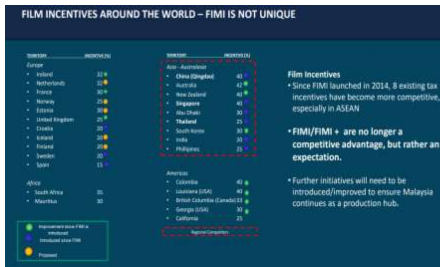
Table 2: Incentives provided by each country.

Obviously promotion is very important in business. Medik and Middleton (1972) stated that tourism involves the entire activity that starts from a person planning to travel to returning back to the initial destination. Kaynak and Yavas (1981) stated that the language of a person traveling to a destination is to fulfill a certain goal and the goal exists from a factor called motivation. Therefore, for tourism marketing, marketing must ascertain what the real needs of tourists are and then must create a value (pull factor) in their business to serve those needs.