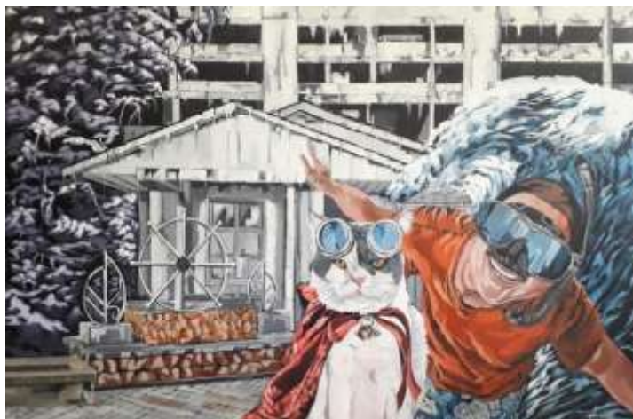
Fig.3: Composition of subject matter of local life with abandoned building in monochromatic color