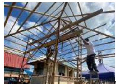
Figure 7 (a), (b) & (c): The installation development

In particular, the overall shape and the interesting element of the rooftop stand out. A dome-shaped rooftop is what is being considered for the final work form, but we have to take into account the factor of stability, so the idea was not accepted. There is the consideration of layering the structure, but that would involve weight issues. Consider the following factors: