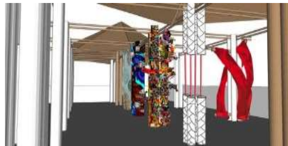
Figure 6: Impression with the arts