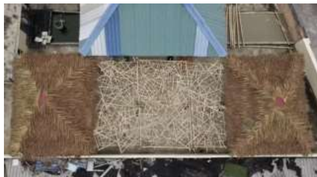
Figure 9: Top view, Bamboo Installation and Mix Media in Size of 60x20x15(h)ft