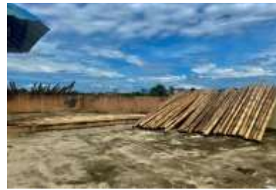
Figure 3 (a) & (b): The location of Installation,