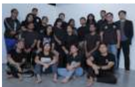
Figure 1: Participating Artists