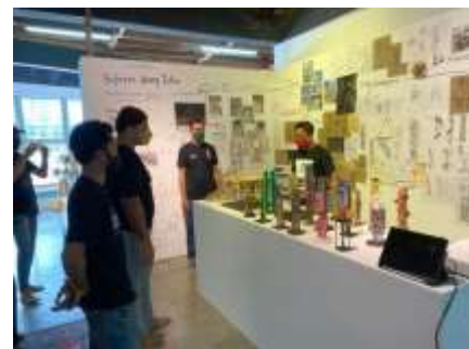
Figure 4 (a), (b) & (c): Dynamic wall where consist of installation sketches, drawings and mock-up development,