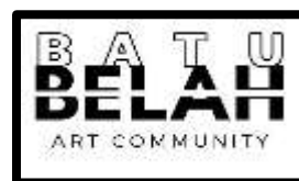
Figure 2: Art Community Logo