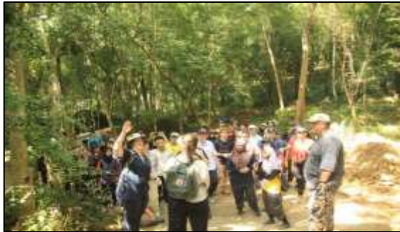
Fig.3: Students from UPM, UiTM and QUT were briefed by a few experts before and after their trekking activities i. Pure science program -Water Quality and Groundwater Study

The stream within PNC was observed before being chosen for on-site water sampling and water analysis using multivariable meter and turbidity meter. It was done by the group with pure science background assisted by a few experts. Water quality analysis was conducted on two different zones with stream where each zone (Figure 4 and Figure 5) was further divided into five points along the stream within PNC. The zone was selected based on accessibility and water availability since PNC was affected by two different seasons (dry and wet season). Finally, only one point from each zone was selected based on consideration and suitability for preliminary data collection. Several parameters were tested such as; Electric Conductivity (EC), Temperature (T), Total Dissolved Solid (TDS), Salinity (S), Dissolved Oxygen (DO) using special water quality test devices. While for pH, odour, floatable and taste at the selected points using portable electronic pH meter at the study side. For Total Suspended Solid (TSS) is tested at hydrology lab at Faculty of Forestry, UPM.