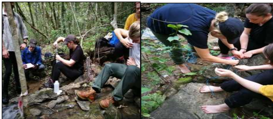
Fig.3 and 4: Students from QUT are taking water quality data and collecting water samples for further data analysis from Zone A and Zone B respectively.

The stream within PNC was observed before being chosen for on-site water sampling and water analysis using multivariable meter and turbidity meter. It was done by the group with pure science background assisted by a few experts. Water quality analysis was conducted on two different zones with stream where each zone (Figure 4 and Figure 5) was further divided into five points along the stream within PNC. The zone was selected based on accessibility and water availability since PNC was affected by two different seasons (dry and wet season). Finally, only one point from each zone was selected based on consideration and suitability for preliminary data collection. Several parameters were tested such as; Electric Conductivity (EC), Temperature (T), Total Dissolved Solid (TDS), Salinity (S), Dissolved Oxygen (DO) using special water quality test devices. While for pH, odour, floatable and taste at the selected points using portable electronic pH meter at the study side. For Total Suspended Solid (TSS) is tested at hydrology lab at Faculty of Forestry, UPM.