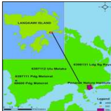
Fig. 1: Location of Penarak Nature Center in Langkawi Island

Nature Center (PNC) by speed boat from Penarak jetty. These students were divided into two groups. The first group is the students who have pure sciences background, while the second group is from social sciences backgrounds. They were asked to prepare a report about their experience and opinion upon conducting all activities in the study area. Before the visit , both groups were given a briefing and explanation about limestone forest by PNC, UPM and QUT experts from social science and pure science perspectives. Video documentary produced by LADA was also used to give the students some information about the limestone forest.