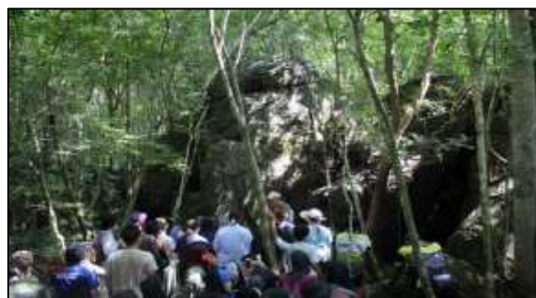
Fig.2: Students from the universities visited small limestone caves formation along the forest trail.

Both groups were taken into the limestone forest by forest trail from Batu Ayam Beach (trail head) to a unique tufa fall of Batu Orkid, which located about 300 meters from the trail head. Besides visiting the tufa fall, they were taken around the limestone forest, to the caves, streams, and had been introduced to some features of limestone forest such as; rock formations, sinkholes, vegetation and wildlife, Figure 2. They were accompanied by a few experts in pure and social science fields. An expert in environmental interpretation gave a briefing and explanation to the students during their forest trekking, Figure 3. The interpretation session covered theory and knowledge about the biodiversity's contribution and their role and relationship towards ecotourism in Langkawi Island.