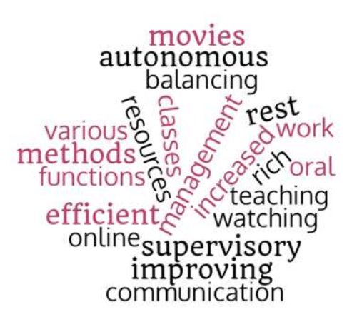
Figure 3: How emerging technologies enhanced online learning

A majority also articulated that learning with emerging technologies improved their communication skills and helped them to be more autonomous. Besides that, they felt that learning engagement online was better as it was flexible and helped them better manage their learning, and it provided a variety of rich learning resources. A few added that emerging technologies provided more fun and efficient methods of learning as they could also watch video clips and movies to relax after long learning sessions. Overall, the respondents viewed emerging technologies in a positive light.