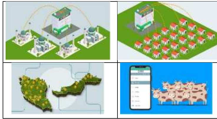
Fig. 2: The illustration of the Online Savings Scheme for Qurban (STIQDAT)