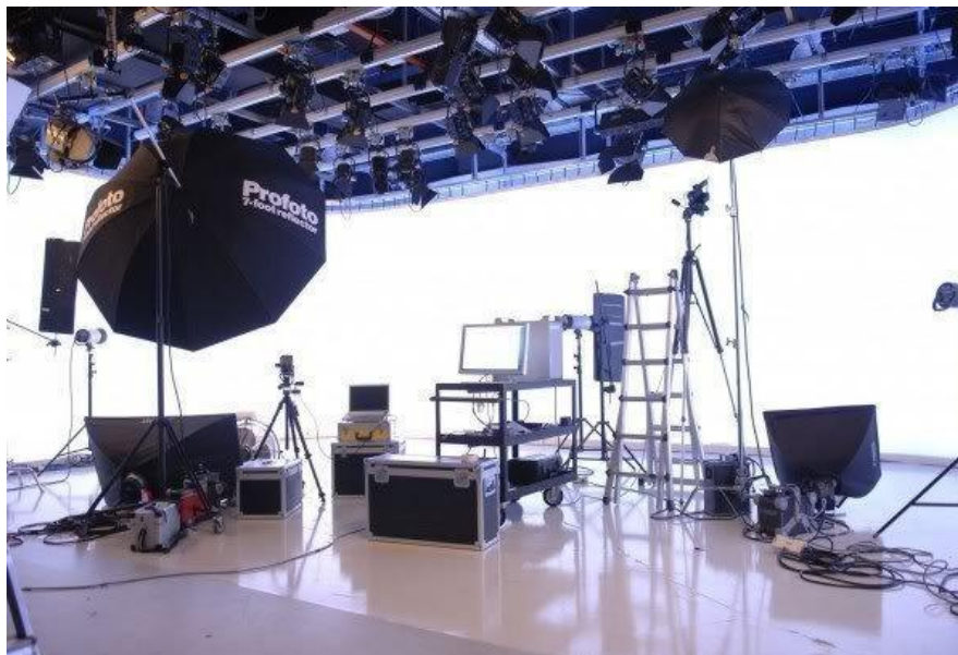
Fig. 1: Studio photography tool.

Photographic art incorporates various cultural, lifestyle, and environmental factors to create visually compelling images. The techniques employed in this art form tailored to the specific concept and production goals, with market demand playing a role. Photography is a ubiquitous technique employed in all forms of media, be it in print or digital format. Photographic images can now generated with a diverse range of technologies. Nevertheless, how can we enhance our image by beginning the process from the beginning? Editorial photography is an artistic expression that aims to showcase the alternative perspective and narrative of a fashion item. As the individual operating the camera, the photographer produces editorial fashion photography that encompasses multiple layers of significance. Fashion photography is commonly associated with elegantly attired models posing in front of the camera (Singh, 2020). Fashion photography plays a crucial role in this process as a means of representation in advertising and the pervasive media (Karen de Perthuis 2019). By approximately 1891, several skilled fashion photographers had developed, and the prevailing focus at that time was on photographs showcasing garments displayed on mannequins (Kruger, 2001).