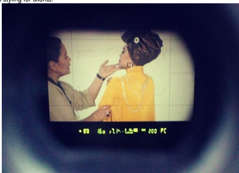
Fig. 4: The Art Director is doing the styling.

Fashion "styling" involves arranging clothes and accessories in a pleasing way for exhibition or sale. Choosing other products might include modelling garments with or without a mannequin. Fashion involves trying on a wardrobe's items to get the right fit. Fashion styling includes editorial styling for periodicals, commercial styling for ads, fashion shows and events, and personal styling for clients. Wardrobe styling, fashion editing and assistance at periodicals, and personal shopping at fashion shops are all forms of fashion styling. "More and more, stylists are the eyes and ears of fashion designers, secret weapons that walk the streets to find interesting reference material, whether a colour on a vintage garment or a monograph by an unknown artist." "Stylists are increasingly the eyes and ears of fashion designers." (2021, Tamsin Blanchard) Fashion style includes editorial (for publications), commercial (for ads), fashion shows and events, and personal styling for clients.