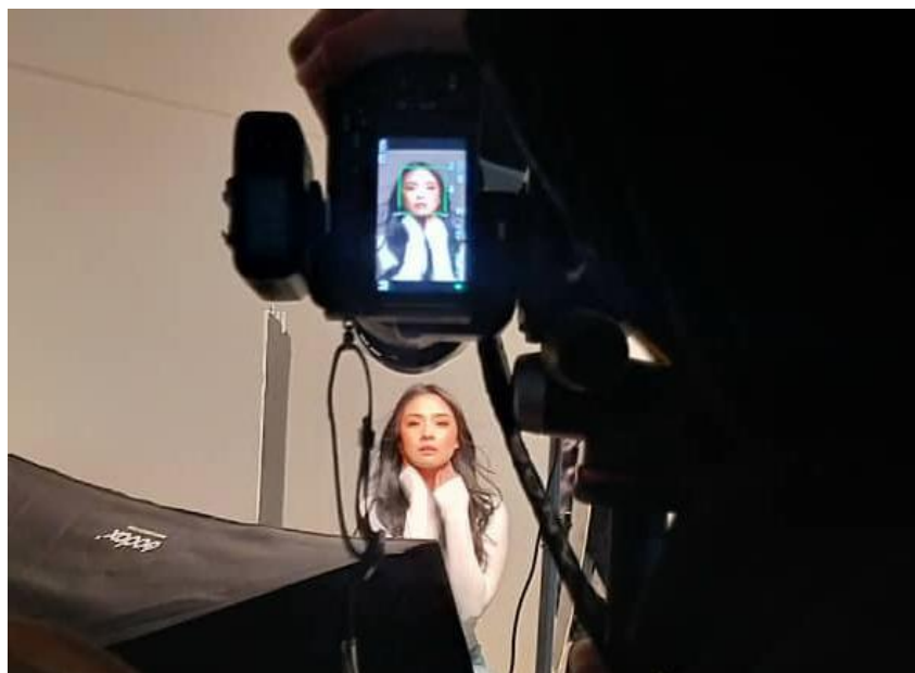
Fig. 2: Photography session in a studio.