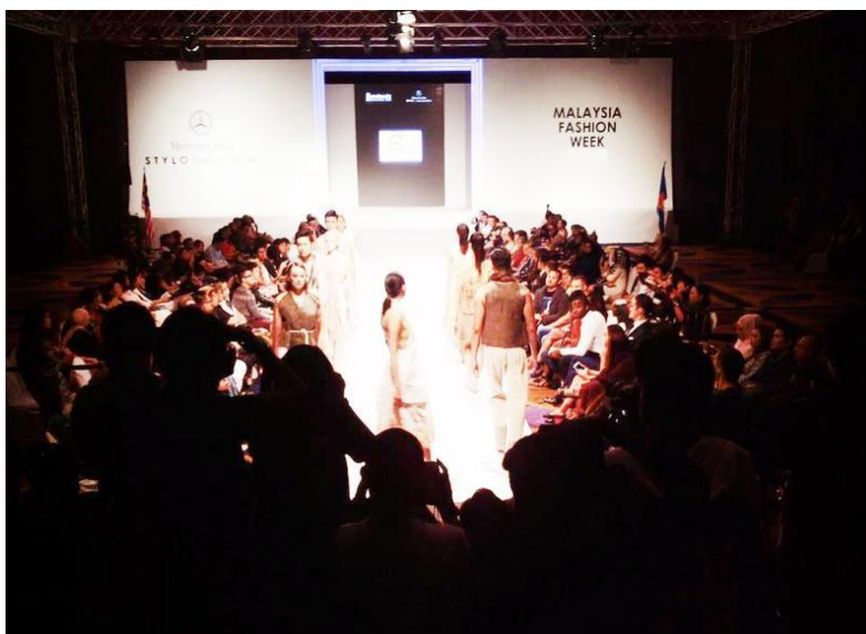
Fig. 3: Malaysia Fashion Week, one of the established fashion shows in Malaysia.

As a result of the fashion industry's close relationship with the media and editorial, each of which functions as a marketing channel or instrument, the culture and environment of society are susceptible to persuasion and influence. When attempting to encourage more environmentally responsible purchases, the fashion media must employ both emotional and logical arguments. Purchasing with restraint, deliberation, and simplicity must become a mainstream option society supports and contribute to consumers' increased self-assurance (Anastasia Denisova, 2021).