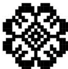
Figure 2: Motif is redrawn by Asrul Asshadi Mohamad Morni, 2021. The motif of ros ayeng and adapted from Cik Hajah Sa'annah Suhaili sketchbook from Kampung Rajang, Sarikei, Sarawak.

In Figure 1, the tapok pedadah shows its characteristics; this motif is unique and passed down from generation to generation among weavers as a cultural and heritage motif. It comprises four (4) and eight (8) shattered petals and has a water rope in the centre. This is the traditional Melanau motif passed down from generation to generation and is synonymous with Suket Ajang fabric. This design exemplifies the nature of weavers' honesty and openness, particularly in the weaving and creation of this Suket Ajang. The Suket Ajang will only take place with honesty and openness, as seen in the weaving process, based on every inch of perfection of the woven yarn (Kifli, 2021). According to my observations, every weaver in Kg Rajang possesses these characteristics, particularly the nature of their openness to the process of assimilation and cultural mixing that occurs as a result of plural marriages and so on. As a result, the tapok pedadah pattern is a symbol of that nature and a reflection of the diversity of the people in Kg Rajang.