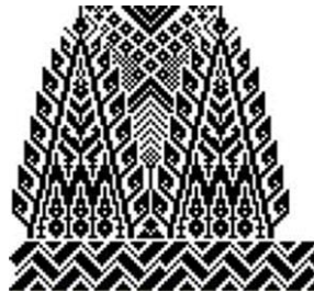
Figure 4: Motif is redrawn by Asrul Asshadi Mohamad Morni, 2021, adapted from Cik Hajah Sa'anah Suhaili sketchbook from Kampung Rajang, Sarikei, Sarawak.

Figure 3, the motif of Usog Rebung Amut , shows their characteristics. This motif was inspired by one of the creeping root plants in the vicinity of Kg Rajang. Therefore, this motif is shaped by a creeping root bond and a combination of geometric shapes. The position of each pattern is determined by the Sifir Ajang formula used. This motif is inspired by the shape of mangrove roots found in Kg Rajang's swampy area. This motif is distinctive in that it represents the clash of cultures between ethnic groups along the Rajang River and the collision of fresh and saltwater in the roots of the mangrove tree. Therefore, the Usog Rebung Amut motif is formed, which is beautifully arranged on the head of the Suket Ajang woven cloth. Apart from symbolising the clash of cultures, it also means strength and resilience because mangrove wood is synonymous with durability, especially in house making. Similarly, when it is used to make woven patterns, it shows how long and robust Suket Ajang is (Husaini, 2021).