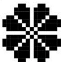
Figure 1: Motif is redrawn by Asrul Asshadi Mohamad Morni, 2021. The motif of tapok pedadah and adapted from Cik Hajah Sa'annah Suhaili sketchbook from Kampung Rajang, Sarikei, Sarawak.

In Figure 1, the tapok pedadah shows its characteristics; this motif is unique and passed down from generation to generation among weavers as a cultural and heritage motif. It comprises four (4) and eight (8) shattered petals and has a water rope in the centre. This is the traditional Melanau motif passed down from generation to generation and is synonymous with Suket Ajang fabric. This design exemplifies the nature of weavers' honesty and openness, particularly in the weaving and creation of this Suket Ajang. The Suket Ajang will only take place with honesty and openness, as seen in the weaving process, based on every inch of perfection of the woven yarn (Kifli, 2021). According to my observations, every weaver in Kg Rajang possesses these characteristics, particularly the nature of their openness to the process of assimilation and cultural mixing that occurs as a result of plural marriages and so on. As a result, the tapok pedadah pattern is a symbol of that nature and a reflection of the diversity of the people in Kg Rajang.