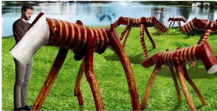
Fig. 4: The conceptual adaption of the "Running Forest" showing the interaction in public environmental art and abstract wooden sculpture

The interaction with the public abstract sculpture and the coordinated change with the environment is more important in public environmental art abstract sculpture (Figure 4). The sculpture is one of the elements that embody and express the connotation of works as an affiliate of environmental elements to the community. This project explores the relationship between abstract sculpture and the environment through an examination of space environment characteristics. Artists and their unique creative perspectives are invited to participate in the city's decision-making process thanks to public art. A non-sanctioned work may be the result of an artist-initiated project, an invitation from an official entity, or no official involvement at all. The presentation of alternative viewpoints through public art has the potential to challenge preconceived notions, held beliefs, and core community values. Public abstract sculpture adds value to cities on multiple fronts, including the cultural, social, and economic spheres. The addition of artwork to public areas brings a sense of humanity to the surroundings and revitalises public places. It creates a point of connection between the past, the present, and the future, as well as between different fields of study and ideas. Our culture is reflected and revealed through public abstract sculpture art, reflecting and revealing our culture.