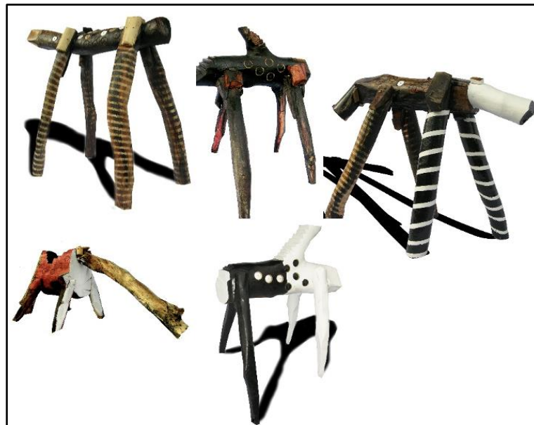
Fig. 2: "Running of the Forest," Variable Size, Wood, Bitumen, Wood Stain, and Wax, 2008. (Source:Ramlan Abdullah's photo and artwork)