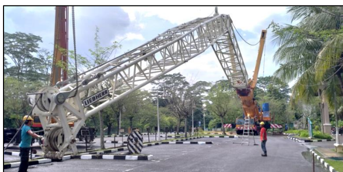
Fig. 1: An example of chiller retrofiting under IIUM's energy-saving initiative (Rustam Khairi Zahari, 2019)

Subsequent to the above exercise, the Company presented its audit findings to IIUM on 9 th September 2015. The proposal stipulates that a significant amount of savings can be achieved from energy-saving efforts in the following areas of MSB/Transformer, Chiller Plant, Small AC System (2.0 HP and above), and finally the Lighting system. Based on the presentation, IIUM decided to opt for the option involving full chiller replacement with a guaranteed minimum amount of savings and no upfront investment by IIUM (Fig. 1). The full chiller replacement covers 18 out of 20 duty chillers with comprehensive maintenance throughout the contract period of 12 years. Thus, there is an additional saving for comprehensive maintenance and capital investment for new chillers.