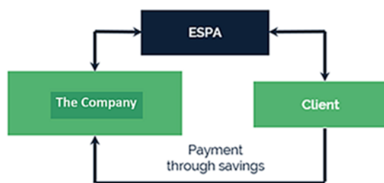
Fig. 2: Schematic Representation of the ESPA Model

Following the approval, IIUM and the Company entered into an Energy Saving Performance Agreement (ESPA) on 30 th September 2016, covering a Contract duration of 12 years. ESPA is a unique no-cost financing program that helps building owners reduce their carbon footprint and save energy with zero capital outlay. With ESPA, the cost of investment to implement measures for energy efficiency will be provided by the Company, and IIUM as the building owner will pay the Company from the savings in the electricity bills. Fig. 2 and Fig. 3 show the Schematic Representation of the ESPA Model and ESPA Shared Savings Model entered between the Company and IIUM.