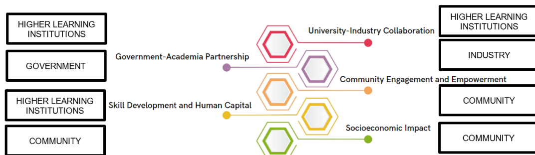
Fig. 2 The nexus of SULAM initiatives and quadruple helix stakeholders (government, higher learning institutions, industry, and community)

The findings indicate that the nexus of service-learning initiatives and quadruple helix stakeholders encompasses five main themes: University-Industry Collaboration, Government-Academia Partnership, Community Engagement and Empowerment, Skill Development and Human Capital, and Socio-economic Impact, as summarized in Fig. 2.