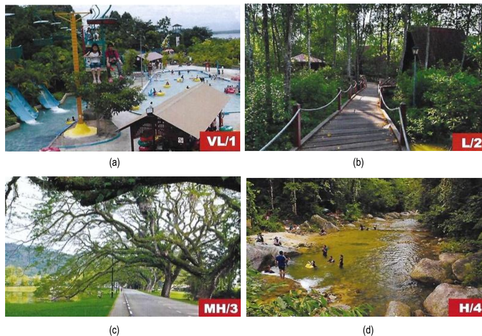
Fig. 2: (a) Bukit Merah Waterpark; (b) Kuala Sepetang; (c) Taman Tasik Taiping; (d) Burmese Pool

However, only four images were selected and evaluated by the natural level of the child's age and their ability. Location of image VL/1 was at Bukit Merah Waterpark where it consist of water, plants and playground; image L/2 was at Kuala Sepetang, which consist of water, plants, decking and gazebo; image MH/3 at Taman Tasik Taiping, consist of tree, water and roadways, and lastly image label H/4 is at Burmese Pool, Bukit Larut. This image shows a natural waterfall consist of rock, water, and plants.