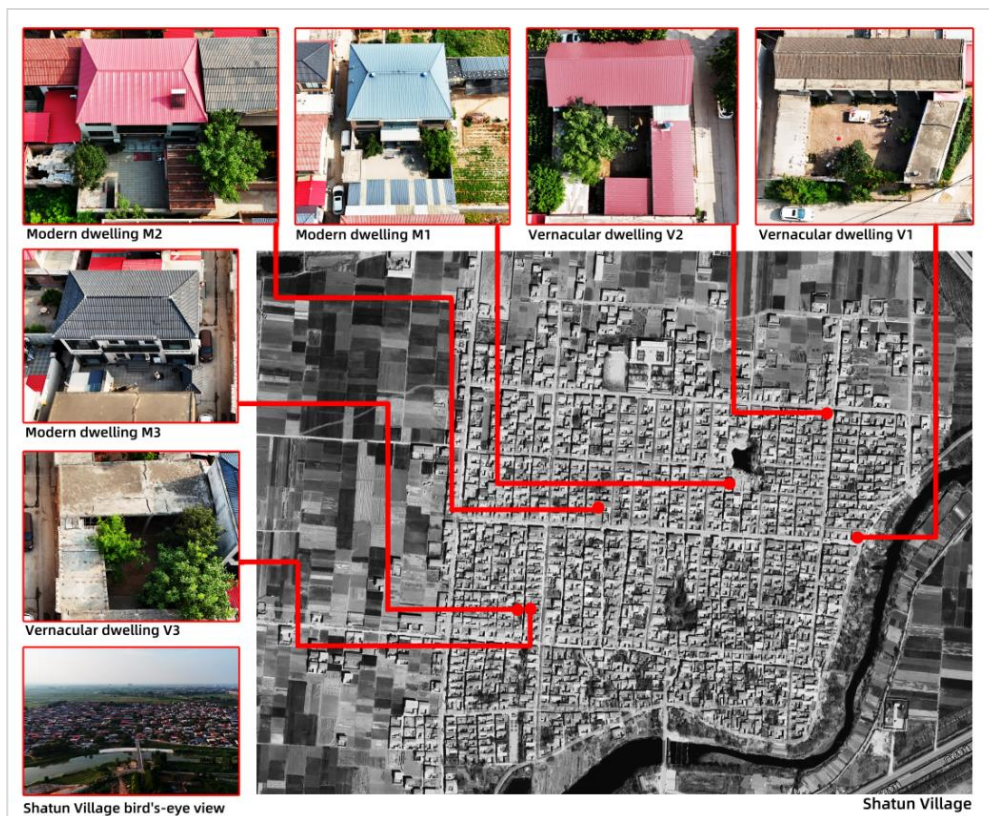
Fig. 2: Study Area Location and the Condition of Houses in the Surveyed Village