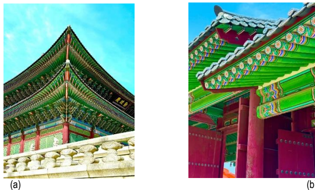
Fig. 1. (a) Dancheong decoration on palace roof; (b) Traditional Dancheong Korean decorative pattern.