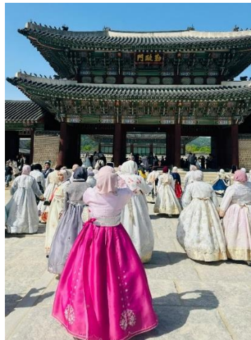
Fig. 2. The main gate of Gyeongbokgung Palace

Figure 2 Gyeongbokgung Palace Gwanghwamun Gate is significant because it is the main entrance to the royal palace and symbolizes the authority of the Joseon Dynasty. Its grand design shows traditional Korean architecture and Confucian values. It is also a key cultural landmark that attracts tourists and represents Korea’s historical identity.