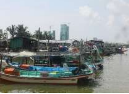
Fig. 2. (a) The construction of new roads linking the Kuala Terengganu City Center (KTCC) in Seberang Takir to Sultan Mahmud Airport (LTSM) via the coast road; (b) The construction of modern terrace house was completed; (c) The fishermen's jetty