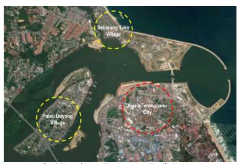
Fig. 1: Maps of the traditional settlement identified in this study

The site is located at Seberang Takir Village and Pulau Duyong Village. It is situated in the district of Kuala Terengganu, Terengganu, Malaysia. Terengganu is one of the states located at the East Coast of the Malay Peninsula, adjacent to the state of Kelantan in its southern part and Pahang state in the south. Terengganu is surrounded by seas and has a large stretch of coconut trees around the coast. The strategic location of Terengganu is located at 500 km northeast of Kuala Lumpur and facing the South China Sea.